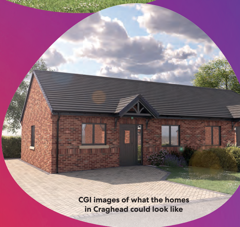
CGI images of what the homes in Craghead could look like

We will continue to look at other sites, including the board school site on Stanley Front Street, and explore how we can deliver new homes to meet the demand for affordable housing in the county.